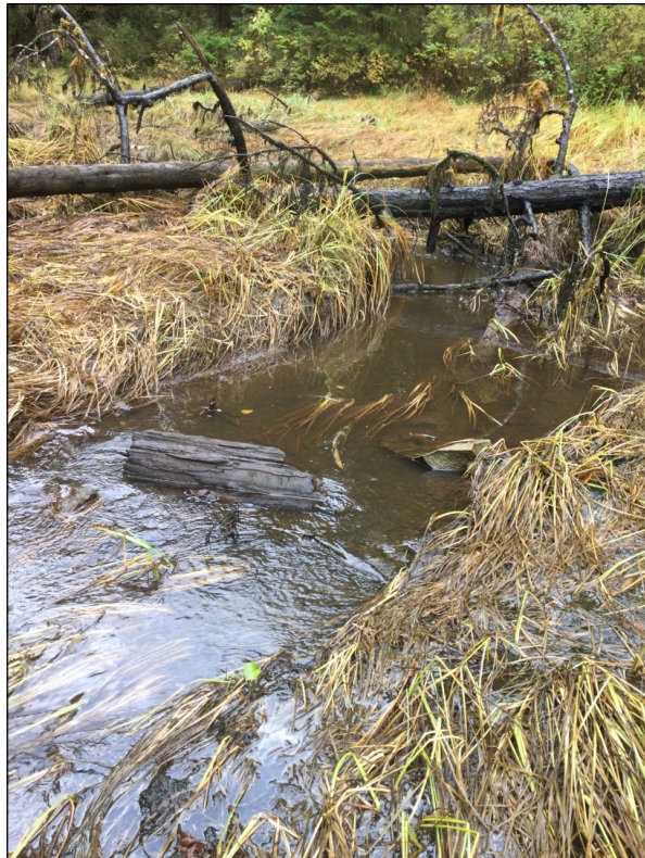
Figure 1.—Channel at waypoint 3156, live pink salmon in center.