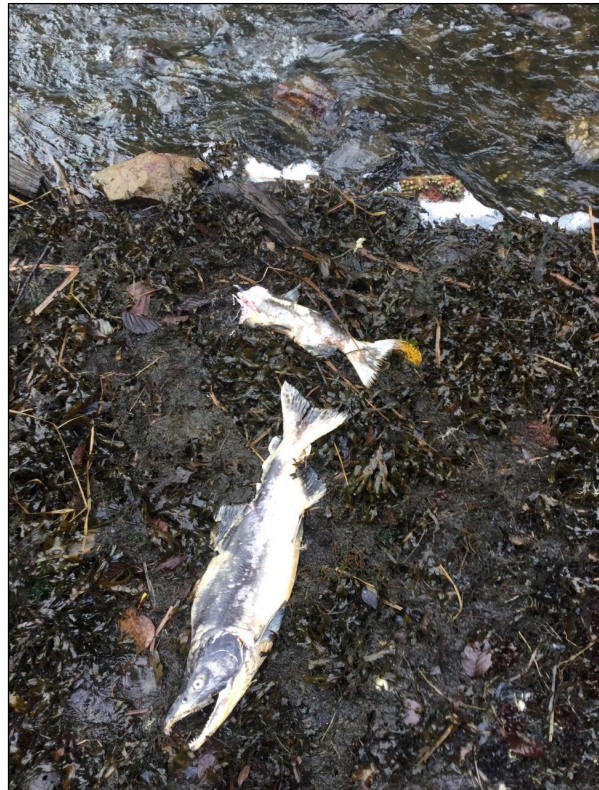
Figure 2.—Pink salmon carcasses.